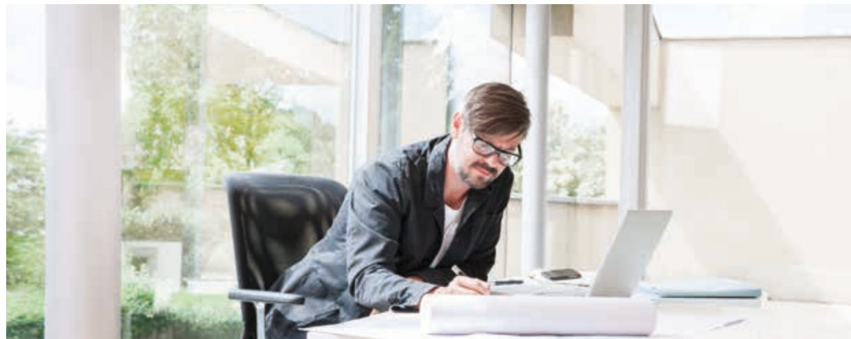
Without privacy and glare protection

Take advantage of daylight, avoid glare and protect your spaces from overheating during the summer.