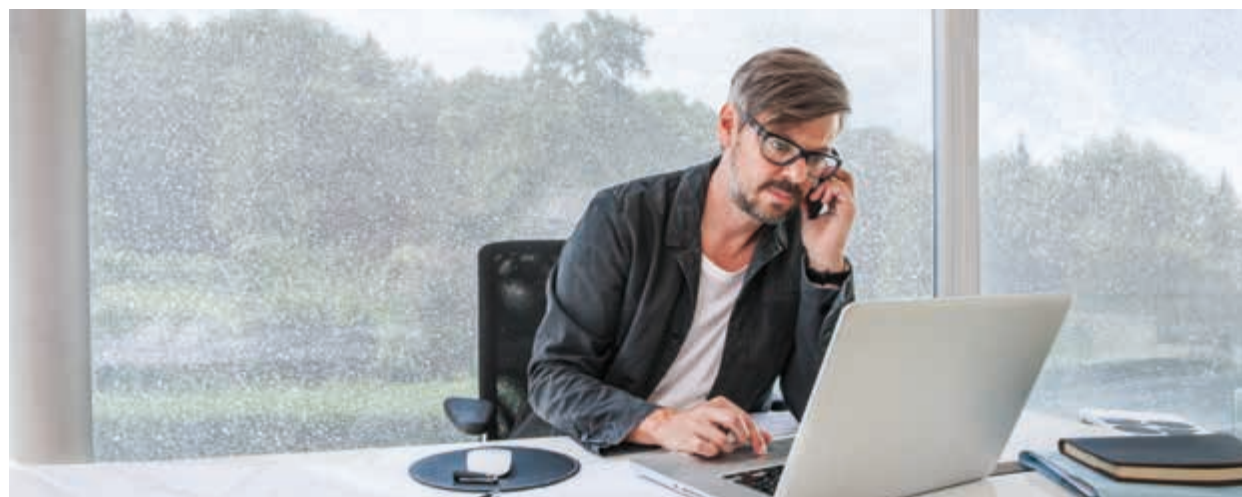
With Twilight METAL 297 P90 Platinum